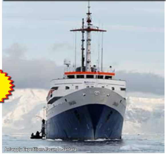
Antarpply Expeditions Facundo Santana