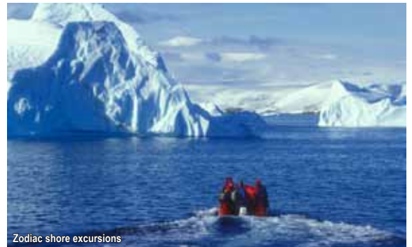
Zodiac shore excursions