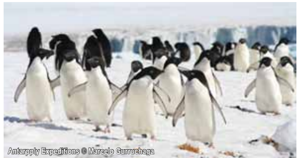
Antarpply Expeditions © Marcelo Gurruchaga