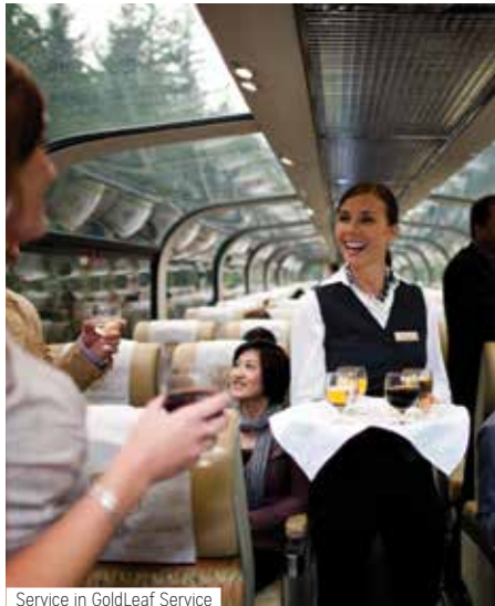
Service in GoldLeaf Service