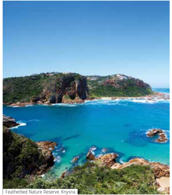
Featherbed Nature Reserve, Knysna