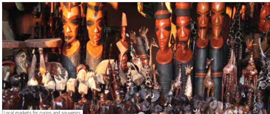
Local markets for curios and souvenirs