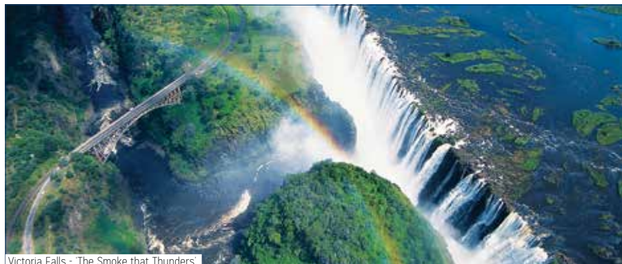
Victoria Falls - 'The Smoke that Thunders'