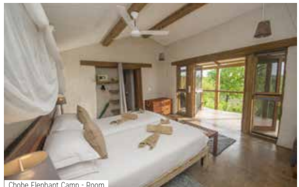
Chobe Elephant Camp - Room